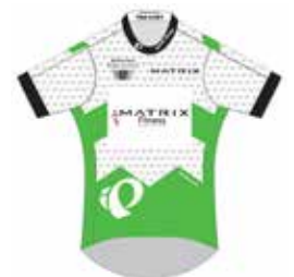
CHAIN REACTION CYCLES POINTS JERSEY The points jersey is worn by the rider who has earned the most points in the series so far, points are awarded at three mid race sprints and to the top five riders at the finish.