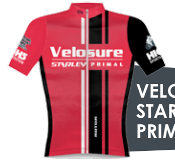
VELOSURE STARLEY PRIMAL