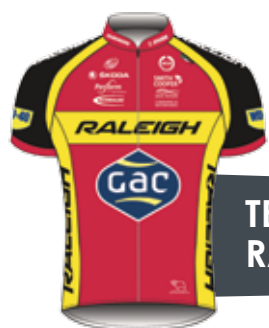
TEAM RALEIGH GAC