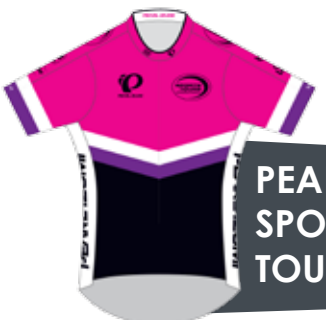
PEARL IZUMI SPORTS TOURS