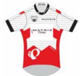
PEARL IZUMI LEADERS JERSEY Worn by all 5 riders of the fastest team in the series and will be presented for the first time to the winning team at Redditch.