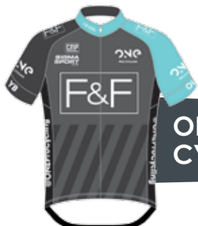
ONE PRO CYCLING