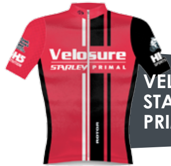
VELOSURE STARLEY PRIMAL