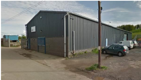
Photograph 2: Building B1 along the sites northern boundary