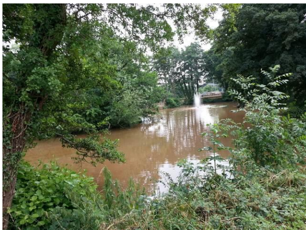
Photograph 1: Pond P1 located adjacent to the sites eastern boundary