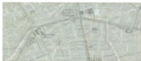
1905 OS map overlaid on a modern map

Marlfield Barn is all that remains of Marlfield Farm. The barn was converted in the 1970's into a community centre, where Church Hill 1st scout group are based.