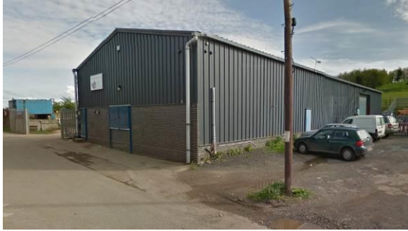
Photograph 2: Building B1 along the sites northern boundary