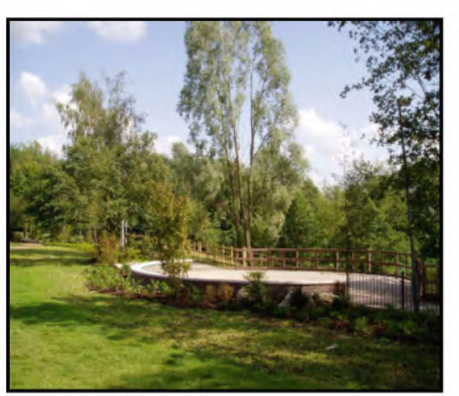
Figure 2 Arrow Valley Park 2