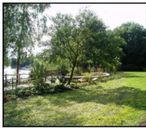
Figure 1 Arrow Valley Park 1

4.2.2 <u>http://www.greenflagaward.org.uk</u> defines the Green Flag Award as the national standard for parks and green spaces in England and Wales. The award scheme began in 1996 as a means of recognising and rewarding the best green spaces in the country. It was also seen as a way of encouraging others to achieve the same high environmental standards, creating a benchmark of excellence in recreational green areas. Arrow Valley Country Park, pictured below, received a quality score of 62, which exceeds the Borough average of 43.