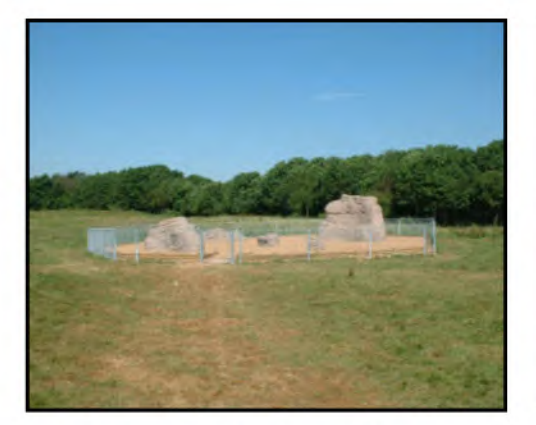
Figure 7 Boulders in Arrow Valley Countryside Centre