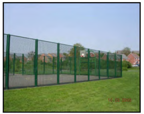
Figure 8 Brockhill Park