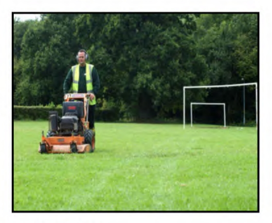
Figure 4 - Playing Pitch