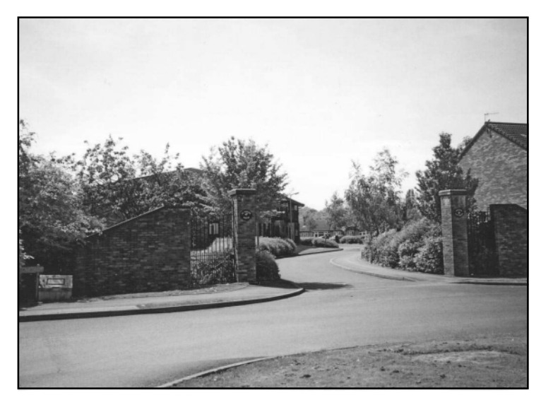
Entrance features reinforce a sense of privacy

Further advice can be sought from the West Mercia Constabulary Crime Risk Manager, Development Control Officers or from the good practice guides listed later in this SPG.