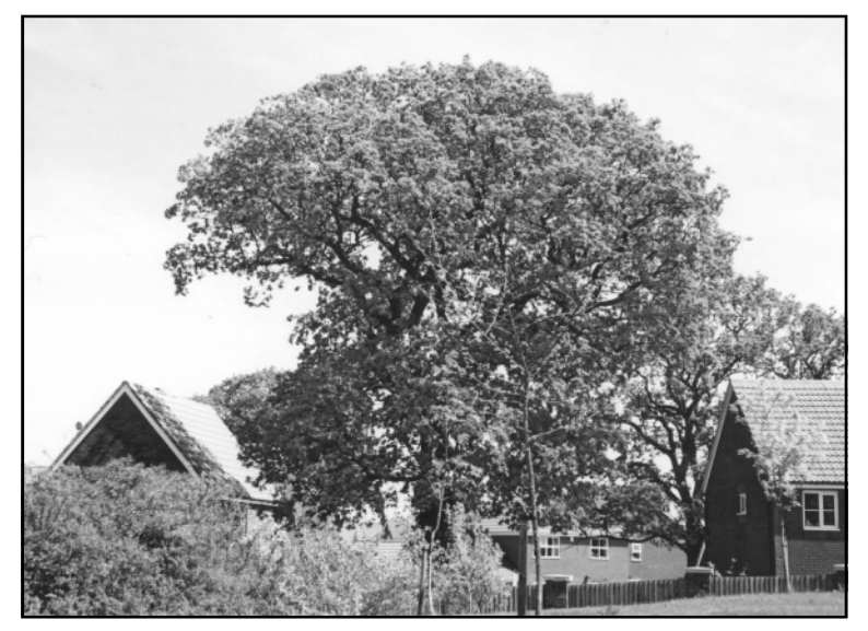
The retention of natural features can enhance the appearance of a new development

maximising the views from and of the development or by creating a frame for neighbouring sites.