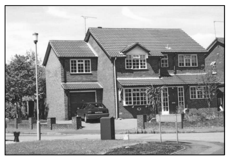
A two storey side extension which is in keeping with the design of the original house

Avoid dormer windows that are deeper than half the depth of the roof slope, and ensure that they have square proportions or a vertical emphasis.