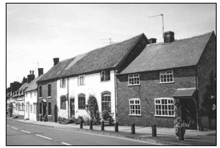
High Street, Feckenham

The village of Feckenham still retains much of its original character. Feckenham was designated as a Conservation Area in 1969 and the Conservation Area was extended in 1995. Given its special character, the Borough Council will require a Design Statement for all new-build residential proposals within the Conservation Area boundary.