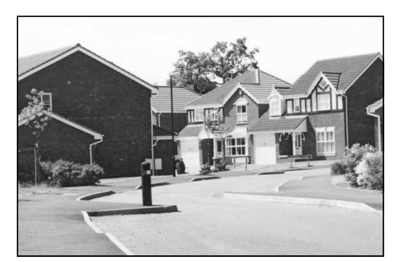
Physical traffic calming measures are part of original design