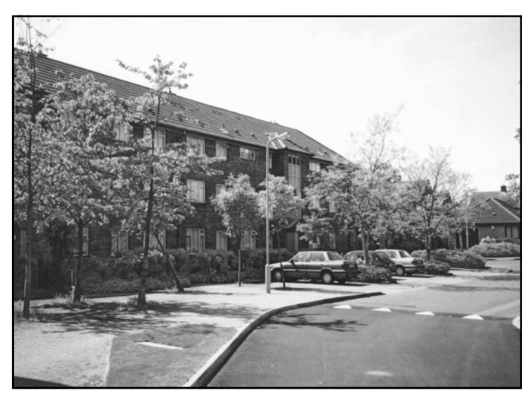
Good natural surveillance of parked cars