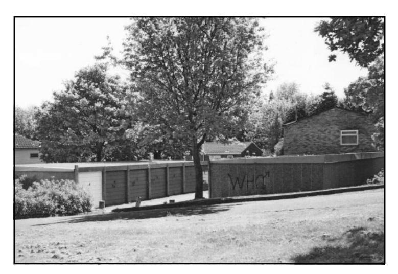
Poor natural surveillance of garage court