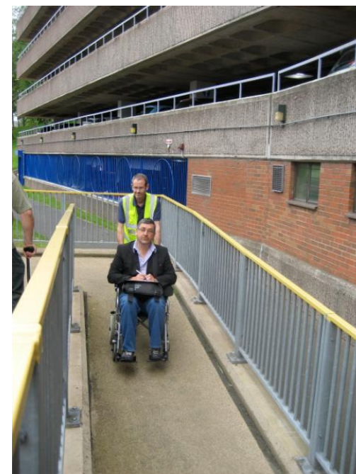
Figure 3: Customers in wheelchairs can be assisted down the ramp. Similar assistance can be provided to pedestrians on foot. The ramp is cleaned as a priority during periods of inclement weather and Shopmobility staff can arrange to bring a scooter to the top of the ramp on request. There is currently, however, no permanent cover over the ramp.