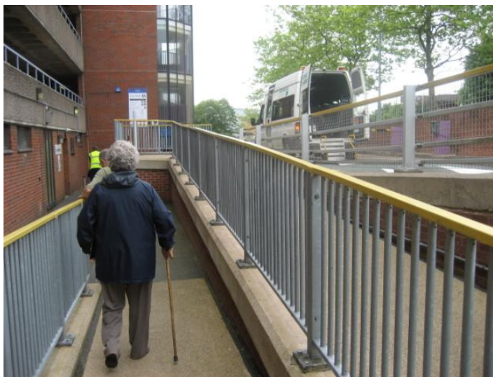
Figure 2: Dial a Ride customers access Shopmobility using a ramp located immediately beside the vehicle stopping point. The ramp uses an “anti-slip” surface which is designed to minimise the risk of customer falls.

Figure 3: Customers in wheelchairs can be assisted down the ramp. Similar assistance can be provided to pedestrians on foot. The ramp is cleaned as a priority during periods of inclement weather and Shopmobility staff can arrange to bring a scooter to the top of the ramp on request. There is currently, however, no permanent cover over the ramp.